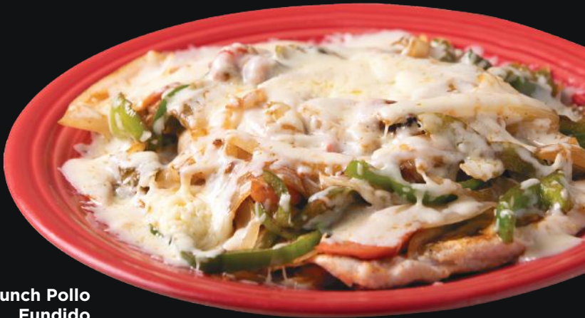
Lunch Pollo Fundido

Cheese quesadilla stuffed with veggies and served with rice and sour cream salad. - 9.25